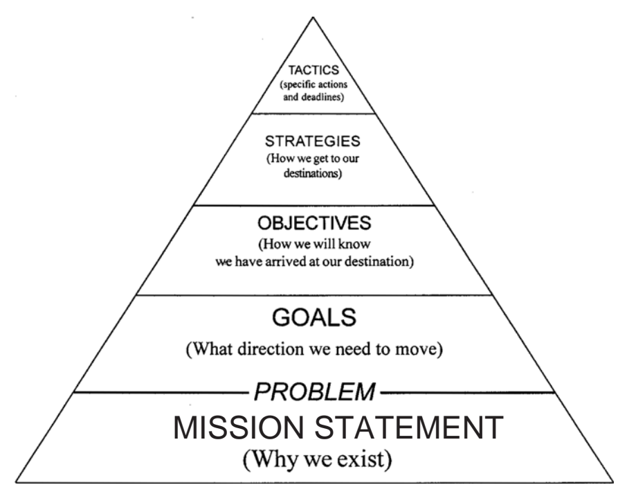
FIG. 2.1. The strategic planning pyramid. The organization's mission forms the basis for strategic planning. Decisions at each level of the pyramid depend on the decisions made on the underlying levels.

the key ingredients of the recipe the manager must develop. They include (a) a mission statement, (b) a problem statement, (c) situation analysis, (d) goals, (e) objectives, (f) strategies, and (g) tactics.